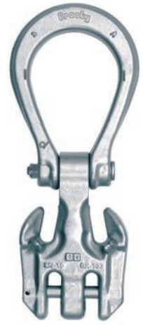
A-1362 Double Hook