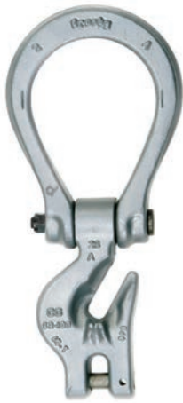
A-1361 Single Hook