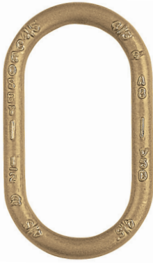
A-342 Alloy Master Links