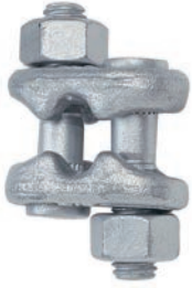
G-429 Fist Grip® Clip 3/16" - 5/8"

Fist Grip® wire clips meet or exceed the performance requirements of Federal Specification FF-C-450 Type III, Class 1, except for those provisions required of the contractor. For additional information, see page 452.