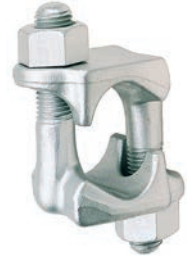
G-429 Fist Grip® Clip 3/4" - 1-1/2"

Fist Grip® wire clips meet or exceed the performance requirements of Federal Specification FF-C-450 Type III, Class 1, except for those provisions required of the contractor. For additional information, see page 452.