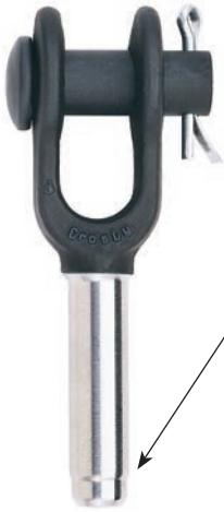
S-501 Open Swage Sockets