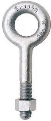
G-291 Regular Nut Eye Bolt